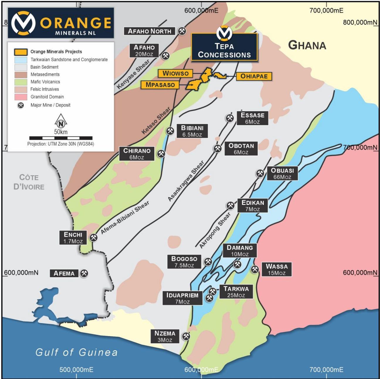
Figure 2 – Regional geology and significant deposits