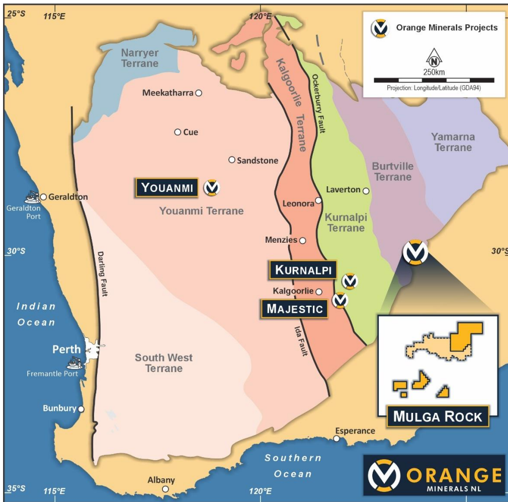
Figure 2 – Mulga Rock Location Map

Mulga Rock is a series of paleo-channel uranium deposits located within a regionally extensive paleo-drainage system (Figure 1). Mineralogy is diverse with a number of critical minerals being present in addition to uranium. The main uranium accumulation within each deposit occurs as a sub-horizontal body found mainly in carbonaceous sediments of lignite and clays. Uranium and base metals were transported laterally from source materials by acid rich meteoric flow, with metals deposited in favourable host rocks close to the water table. At Mulga Rocks mineralisation typically commences at shallow depths of 30-60m.