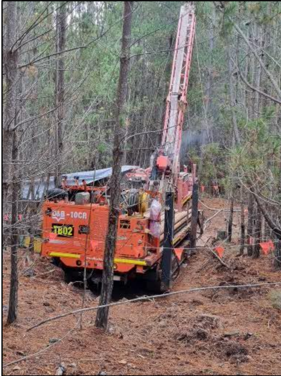
Figure 1- Diamond drill rig at Wiseman's Creek NSW